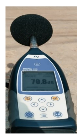
Figure 1. Sound level meter class I.

larly prevalent. Since it differs from person to person, geographical location to geographical space, degree of growth to rapid industrialization noise pollution can be considered a geographic problem. It also differs depending on the causes of the problem and the level of impact which is mostly determined by the amount of exposure and how frequently it occurs. It is a spatiotemporal phenomenon of significant importance since noise levels can vary greatly across different geographical locations. Measuring the noise from vehicles is not an easy task because of the variety of automobiles that are on the roadways, as well as the quality of the roads and the amount of crowding. In addition to these factors, the horns of automobiles are another significant contributor to the increased levels of noise in the surrounding environment (ElAarbaoui et al., 2017). The amount of noise is typically expressed as an equivalent continuous sound level (L_{eq}) and is referred to using the decibel (dB) measurement system. Leq, which stands for "equivalent continuous sound level" is a valuable tool for describing varying noises as a single number (Kumar et al., 2017).